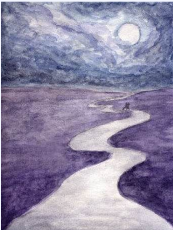
The road was a ribbon of moonlight over the purple moor