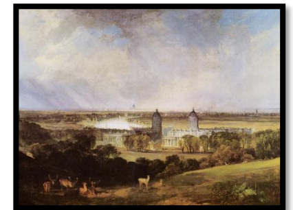
London from Greenwich Park