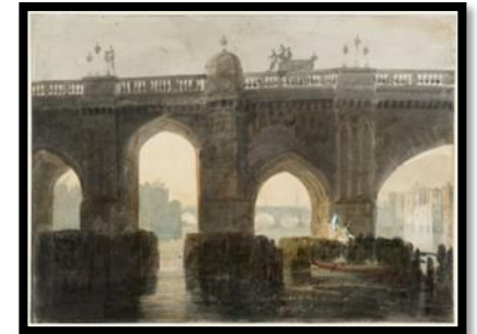
Old London Bridge