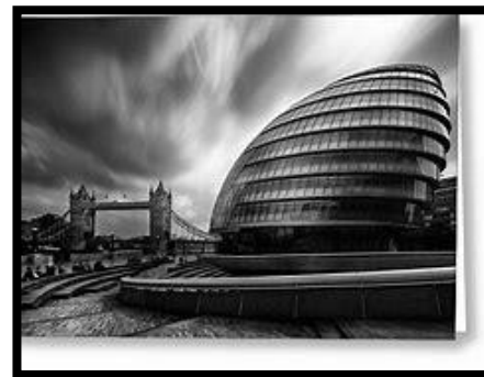
City Hall and Tower Bridge